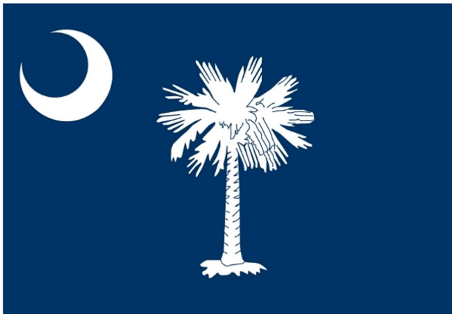
The state flag of South Carolina

To read more on this, click HERE for the full announcement from the Town of Bluffton.