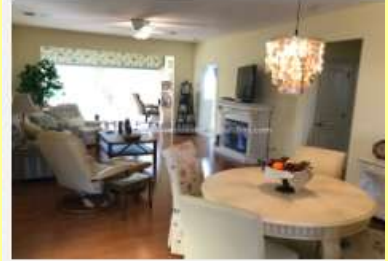
11 Juniper Creek Lane Bluffton, SC

Available Now Bedrooms 2 Bathrooms 2 Rent $1,700.00 Square Footage 1,356 Neighborhood Sun City Furnished Yes