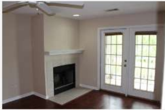
1316 Estate At Westbury Bluffton, SC

Available Now Bedrooms 2 Bathrooms 2 Rent $1,200.00 Square Footage 968 Neighborhood Estate at Westbury Furnished No