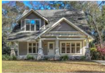
29 Old Sawmill Drive Bluffton, SC

Available 02/01/2020 Bedrooms 3 Bathrooms 2.5 Rent $2,325.00 Square Footage 2,315 Neighborhood Victoria Bluff Furnished No