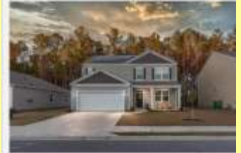
187 Horizon Trail

Available Now Bedrooms 3 Bathrooms 3.5 Square Footage 1,744 Neighborhood Heritage at New Elliptical