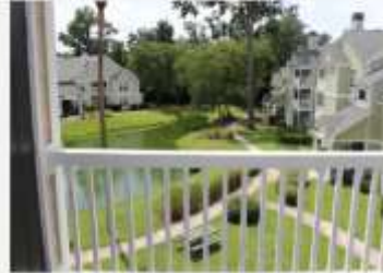
218 Estate At Westbury Bluffton, SC

Available Now Bedrooms 2 Bathrooms 2 Rent $1,200.00 Square Footage 968 Neighborhood Estate at Westbury Furnished No