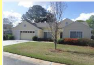
61 Padgett Drive Bluffton, SC

Available 04/01/2020 Bedrooms 2 Bathrooms 2 Rent $1,575.00 Square Footage 1,580 Neighborhood Sun City Furnished Yes