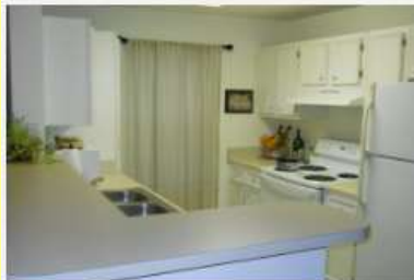
50 Pebble Beach Cove #D110 Bluffton, SC

Available Now Bedrooms 1 Bathrooms 1 Rent $975.00 Square Footage 774 Neighborhood The Reserve at Woodbridge Furnished No