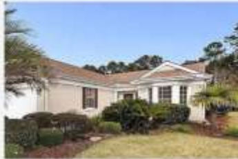
10 Candlelight Way

Available Now Bedrooms 2 Bathrooms 2 Rent $2,500.00 Square Footage 2,109 Neighborhood Sun City Furnished No