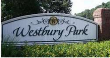
1202 Estate At Westbury Bluffton, SC

Available Now Bedrooms 2 Bathrooms 2 Rent $1,400.00 Square Footage 968 Neighborhood Westbury Park Furnished No