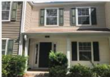
421 Gardners Circle Bluffton, SC

Available Now Bedrooms 2 Bathrooms 2.5 Rent $4,400.00 Square Footage 1,368 Neighborhood The Farm at Buckwater Furnished No